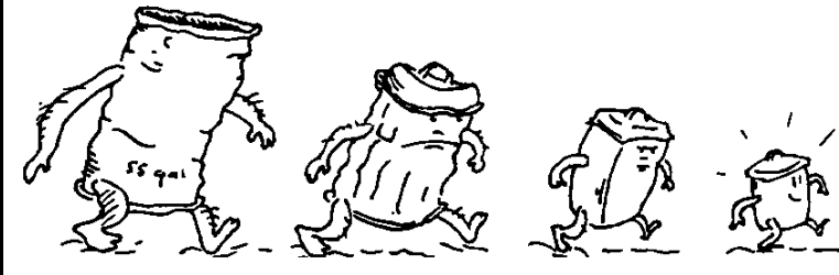
The Evolution of the waste can